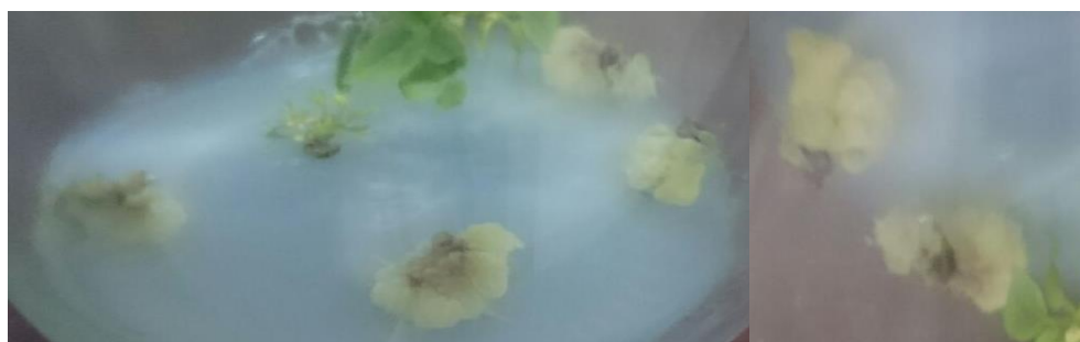
Figure 2 - Callus formation in treatments containing hybrid rose microsamples at a concentration of 0.5 mg/L of NAA and 2 mg/L of BAP