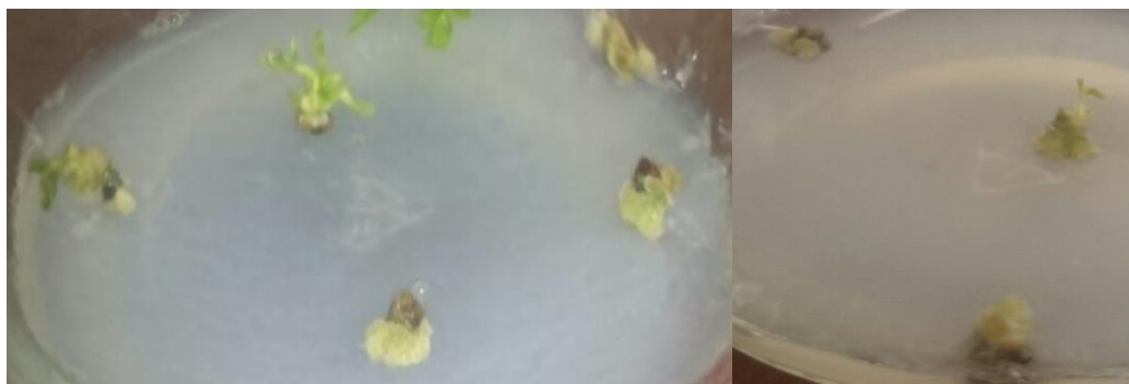
Figure 1- Callus formed hybrid rose microsamples in treatments containing high concentrations of BAP and NAA

concentration of 0.5 mg/L NAA and 2 mg/L BAP (Figure 2). The results of this experiment showed that the absence of NAA hormone caused callus production on its own, but its small amount in the presence of BAP increased bulk of callus.